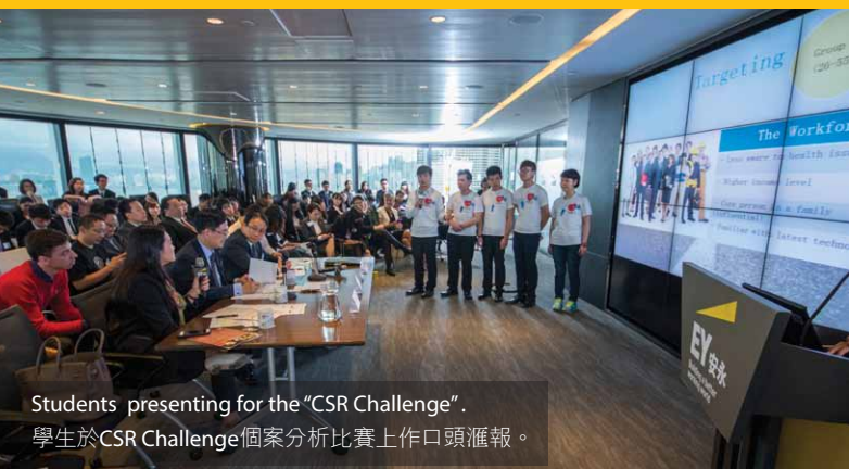
Students presenting for the "CSR Challenge".