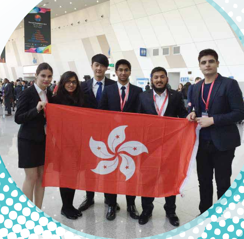
A delegation of six students from CityU attended the WorldMUN 2015 conferences held in Seoul.