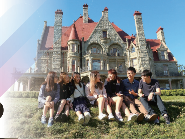
Participants spending their time together after class on a sunny day at University of Victoria, Canada. 同學在加拿大維多利亞大學上課，課後一邊享受溫暖的陽光一邊聊天。