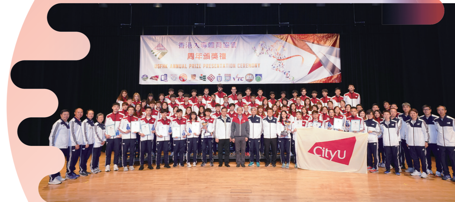
We Soar High with the CityU Flag! 城大勝利的旗幟再次在頒獎台上展現！