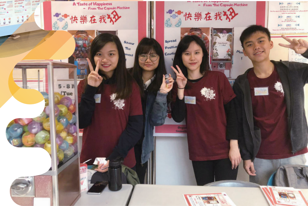
Caring Leaders bring positive vibe and happiness to the CityU Community with the tailored capsule machine during the activity "A Taste of Happiness". 於「快樂在我扭」活動中，關愛領袖利用玩味有趣的扭蛋機和在扭蛋內的小禮物或祝福語為同儕們送上正能量。

心理健康大使的使命是在大學社區宣導心理健康。參加這個工作小組的學生將接受正向心理學、心理健康意識以及團隊合作能力方面的培訓。培訓結束後，他們將成為關愛領袖為同學服務。