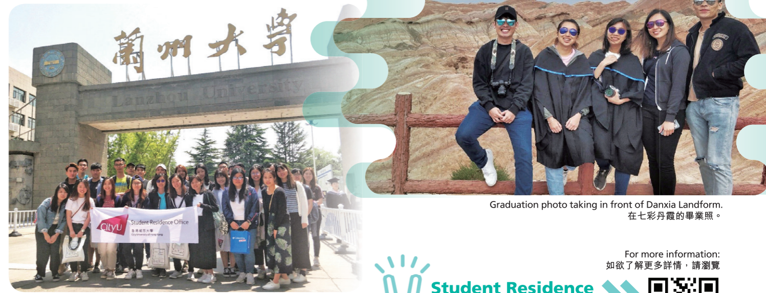
Graduation photo taking in front of Danxia Landform. 在七彩丹霞的畢業照。