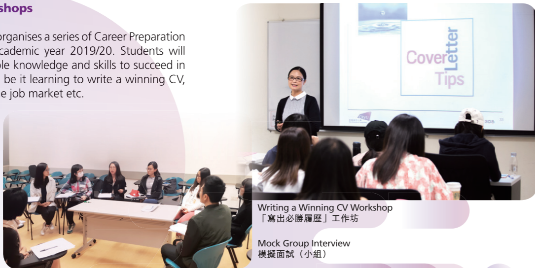
Writing a Winning CV Workshop 「寫出必勝履歷」工作坊

2019/20學年，事業及領袖策劃中心將一如以往，舉辦一系列的事業策劃工作坊。工作坊圍繞豐富的主題，為參加的學生們提供各種訓練和裝備的機會，提升學生相應的求職能力，從而讓學生能夠在芸芸應徵者中突圍而出。