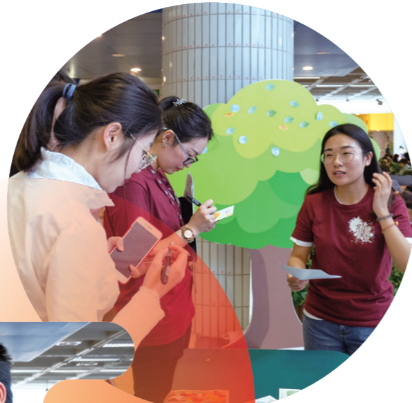
Peer Support Fellows cheer up fellow schoolmates during the pre-examination period! 關愛領袖於考試期間為同學們送上鼓勵!

計劃旨在培訓學生建立關愛校園文化，支援朋輩應對生活挑戰。培訓完畢，同學會對自己有更深入的認識，並掌握基本的輔導技巧和領導才能。其後，關愛伙伴更可在校內籌劃各項服務和活動以推動關愛文化。