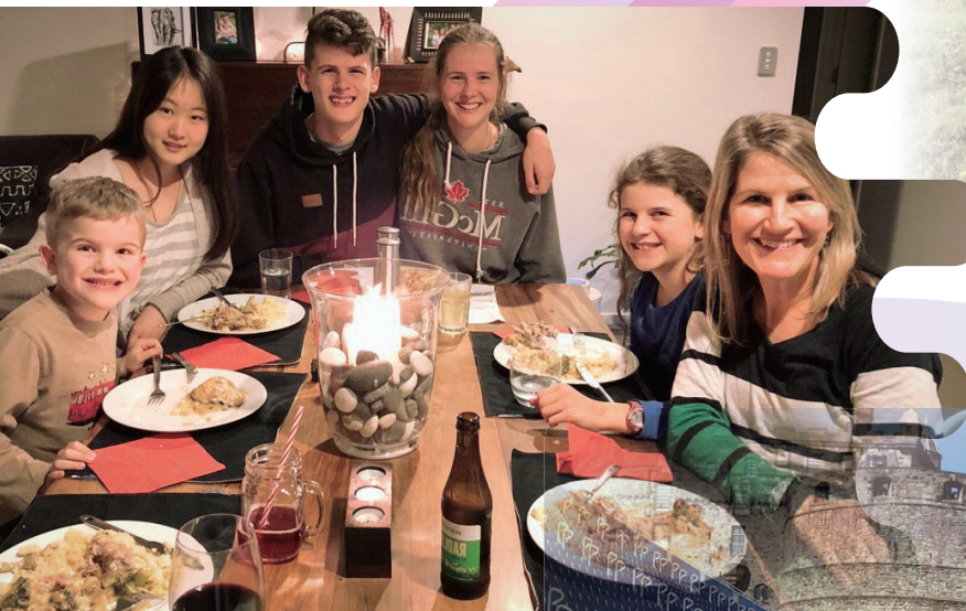
CALIS participant enjoying dinner with homestay family at Auckland, New Zealand. 參加CALIS的同學在紐西蘭奧克蘭與寄宿家庭共晉晚餐。

城大致力提供各種遊學團讓同學接觸各地文化並提升外語能力，當中包括文化及語言體驗計劃 (CALIS)，由城大各學院與國外多所知名大學合作舉辦，讓學生可於外語環境生活4至6星期。同學在學習外語的同時，更可在寄宿家庭生活，親身體驗當地的生活和飲食文化。自2007/08學年開始計劃至今，已資助多名同學參加遊學團，足跡踏遍澳洲、加拿大、紐西蘭、英國等地。城大更於本學年將計劃擴展至非英語為母語的國家，同時亦設立一帶一路地區及大灣區文化體驗計劃，讓學生可踏遍全球。有興趣參加的同學可瀏覽本計劃的網站，並留意各學院公佈的報名資訊。