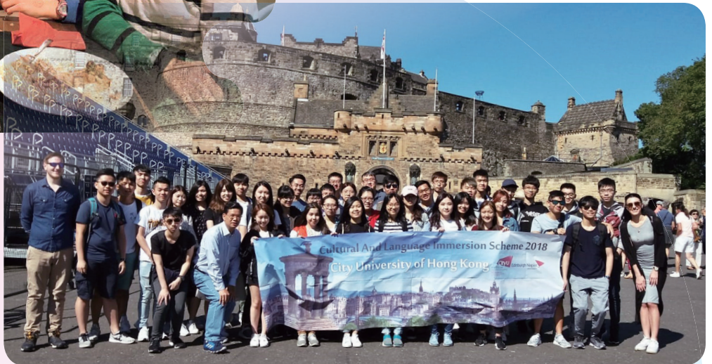
Participants visiting Edinburgh Castle, an iconic site of Edinburgh, United Kingdom. 同學獲安排參觀愛丁堡最重要的名勝，愛丁堡城堡。