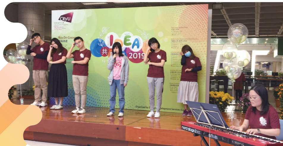
Caring Leaders "singing" with SEN students through Sign Language. 關愛領袖與特殊教育需要學生一起以手語「演唱」。

共融大使的使命是幫助有特殊教育需要 (SEN) 的城大學生擴闊視野和擴展社交網絡。他們還透過籌辦不同的共融活動，積極推動城大師生對SEN同學的了解和認識。