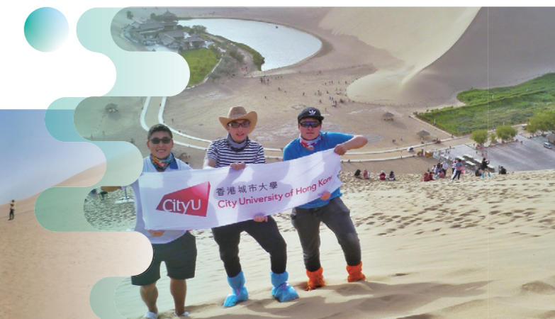
Viewing Crescent Lake from the top of Mingsha Mountain. 在鳴沙山上遠眺月牙泉。