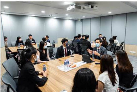
The two guests and barristers from Temple Chambers and Sir Oswald Cheung's Chambers met and interacted with students in small groups after the seminar.

In the subsequent small group session, both guests shared further insights with aspiring barristers-to-be, including practical tips on how to perform well during mini-pupillages and how to better prepare pupillage applications. Students also had the precious opportunity to meet and interact with barristers from Temple Chambers and Sir Oswald Cheung's Chambers in small groups.