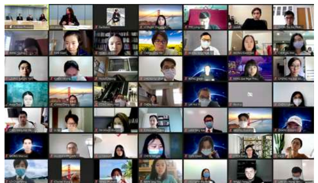
Students listened attentively to the sharing of the three speakers during the webinar. 同學們在線上講座中專注聆聽三位講員的分享。

課程於 2021 年 4 月 8 日舉辦了「與大師爐邊對話——周永健博士，SBS，JP、陳傳仁先生和簡家驄先生」講座，作為這星光熠熠系列的開端。周永健博士現任觀韜律師事務所（香港）的高級顧問，並曾任香港律師會會長和香港賽馬會主席。陳傳仁先生曾任貝克·麥堅時律師事務所的管理合夥人和香港律師會副會長。簡家驄先生是簡家驄律師行的創辦人 and 高級合夥人，並曾任香港律師會的理事會會員。鑒於新冠疫情，該活動在線上舉行，吸引了超過 95 名與會者。