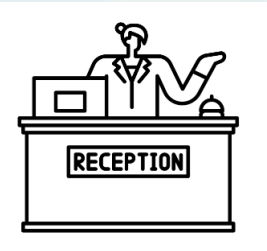
Receptionist of a property company