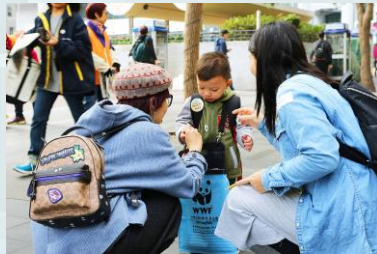
WWF flag selling volunteer