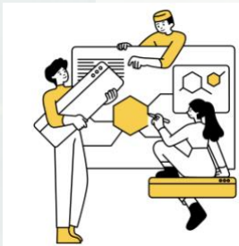
SEE Final-year Project (FYP)