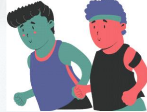
Participant in marathon for climate change