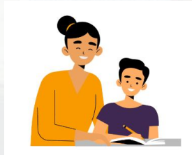
Primary/secondary school students' tutor