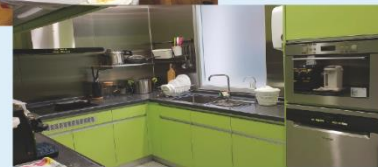
共廚空間 Co-Cooking Space ▼