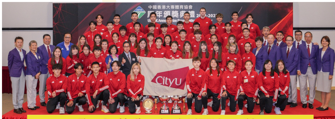
9 Times Double Champions in USFHK Competitions 96-97, 00-01, 07-08, 08-09, 09-10, 10-11, 12-13, 13-14, 16-17

With professional training and dedicated team efforts, CityUHK has become one of the leading universities in sports among local tertiary institutions in Hong Kong.