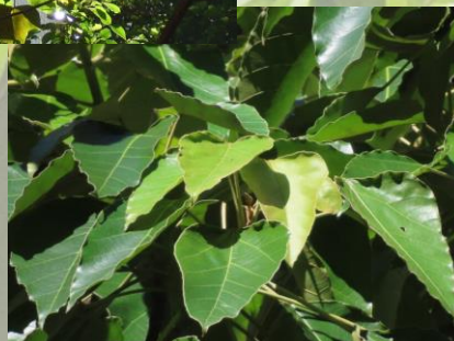
盾狀葉 shield-shaped leaves