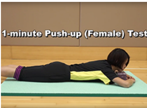
1-minute Push-up (Female) Test