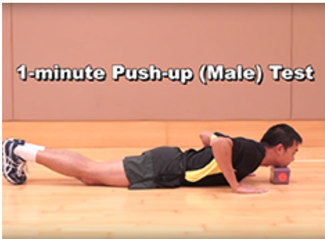
1-minute Push-up (Male) Test