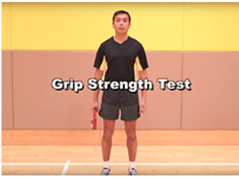
Grip Strength Test