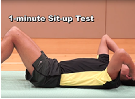
1-minute Sit-up Test