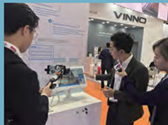
Medical Expo in Dubai