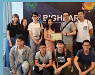
Singapore Study Tour