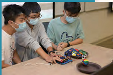
CityU BME Competition