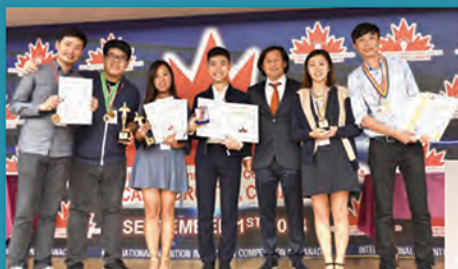
Innovation Competition in Canada