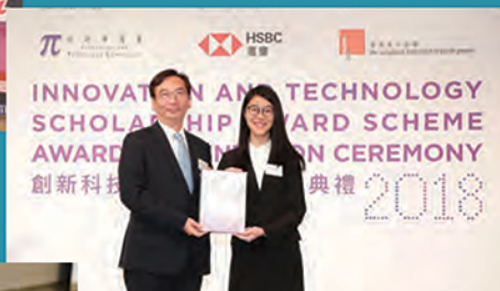
Innovation and Technology Scholarship Award