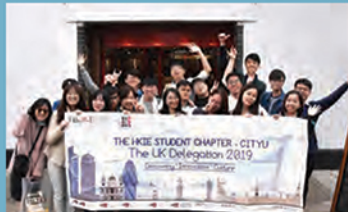
HKIE UK Delegation