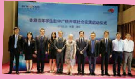
CGN China & UK Internship Programme Sponsored by CLP