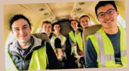
Overseas Internship Scheme