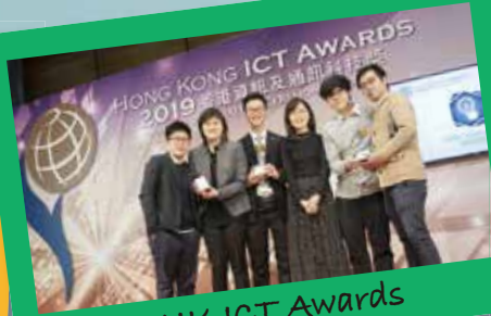
HK ICT Awards