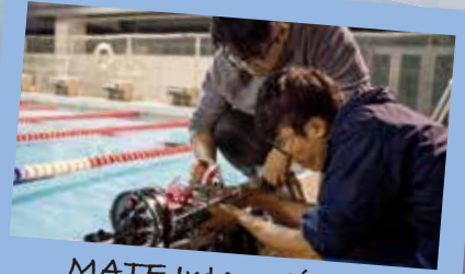
MATE International ROV Competition