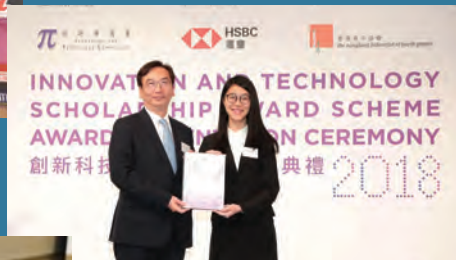
Innovation and Technology Scholarship Award