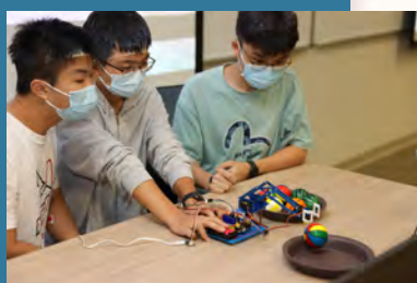
CityU BME Competition