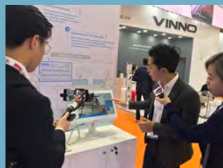
Medical Expo in Dubai