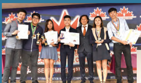
Innovation Competition in Canada