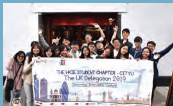
HKIE UK Delegation