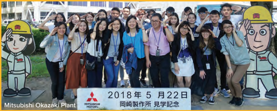
Mitsubishi Okazaki Plant

“ I had the opportunities to reach out to people from different professions and learnt what cannot be found from textbooks or lectures. ”