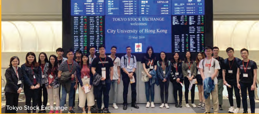
Tokyo Stock Exchange

“ I had the opportunities to reach out to people from different professions and learnt what cannot be found from textbooks or lectures. ”